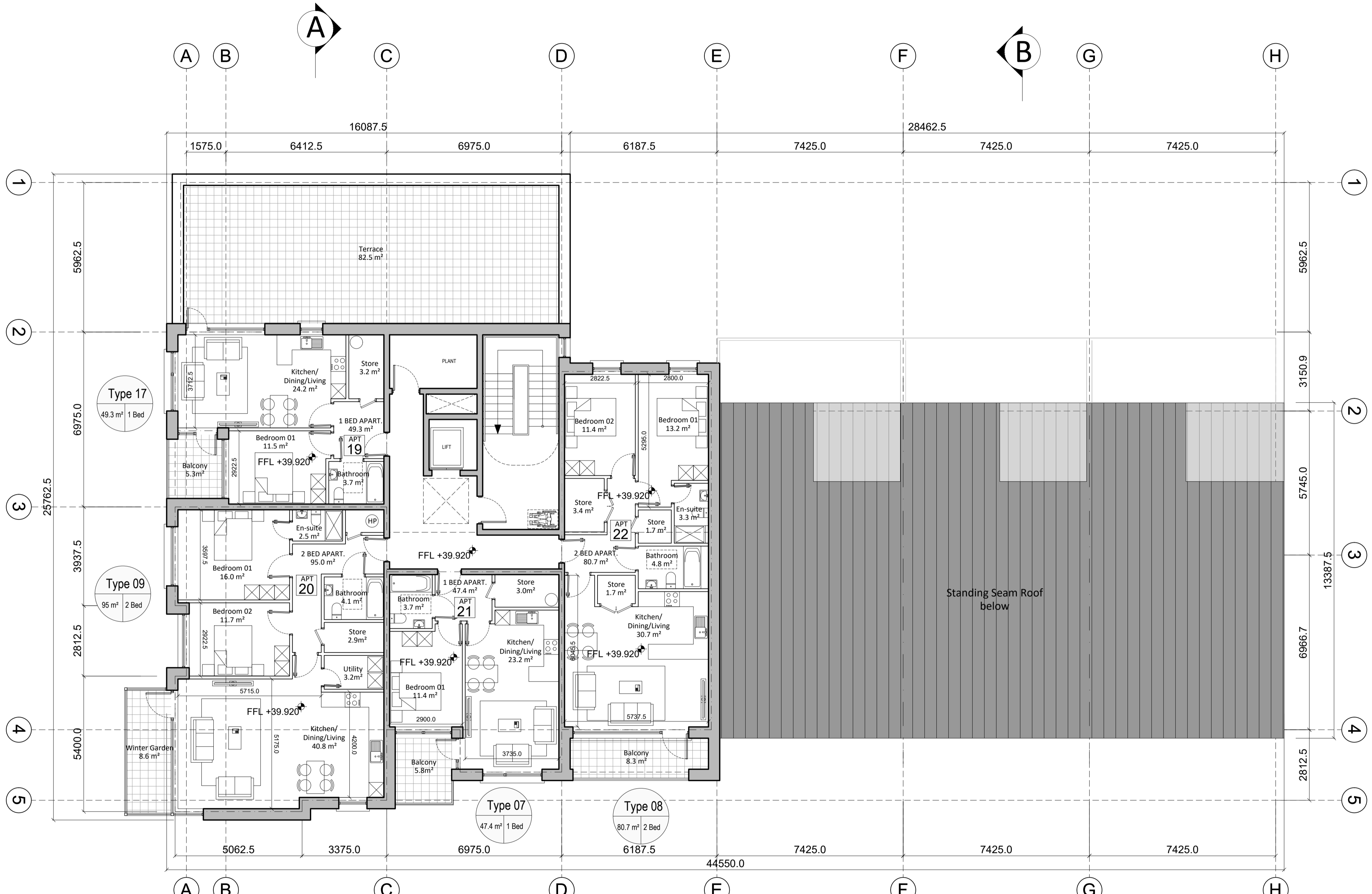
Fourth Floor Plan